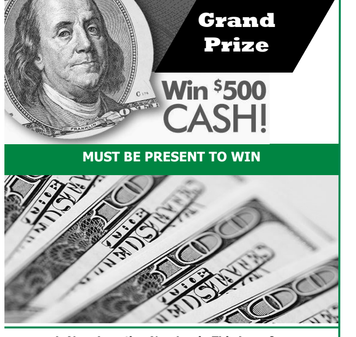
Is Your Location Number in This Issue?

Your service location number begins with two letters and is located on your bill next to your account number. Keep your eyes peeled for the "hidden location number" in this newsletter! If you find the number, and it is your service location you will receive a DCEC fleece sweatshirt! Good luck!